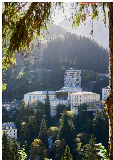
BWM_Bad Gastein_Hotelensemble_01