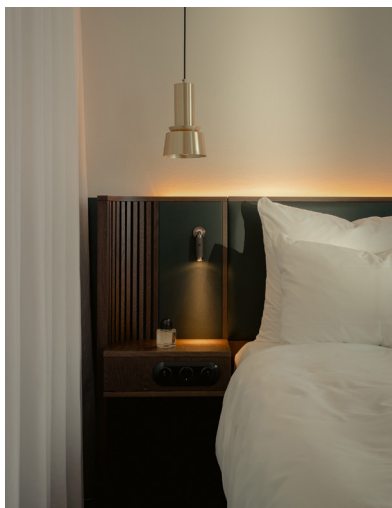
BWM_Bad Gastein_Grand Hotel Straubinger_Room Detai 01_©BWM_Designers & Architects _ Ana Barros