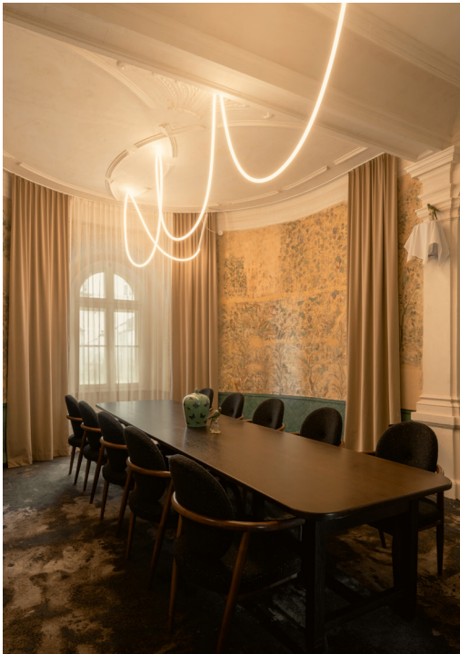
BWM_GrandHotelStraubinger_ PrivateDining_©BWM_DesignersArchitects_ AnaBarros