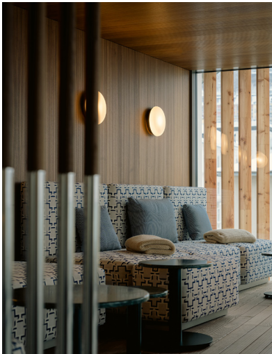
BWM_Bad Gastein_Grand Hotel Straubinger_Spa02