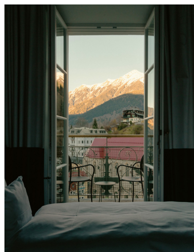
BWM_Bad Gastein_Grand Hotel Straubinger_Room Detail_02©BWM_Designers & Architects Ana Barros