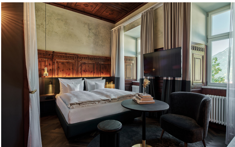
BWM_Bad Gastein_Grand Hotel Straubinger_Pine Suite 02_©Arne Nagel_AMOAeK