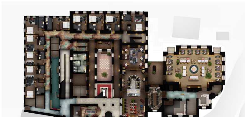
BWM_Bad Gastein_Grand Hotel Straubinger_ groundfloor