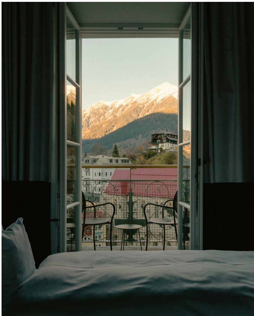
BWM_Bad Gastein_Grand Hotel Straubinger_Suite View ©BWM_Designers & Architects_Ana Barros