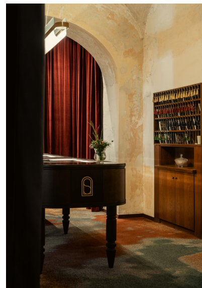
BWM_Bad Gastein_Grand Hotel Straubinger_ Reception01_©BWM_Designers & Architects_ Ana Barros