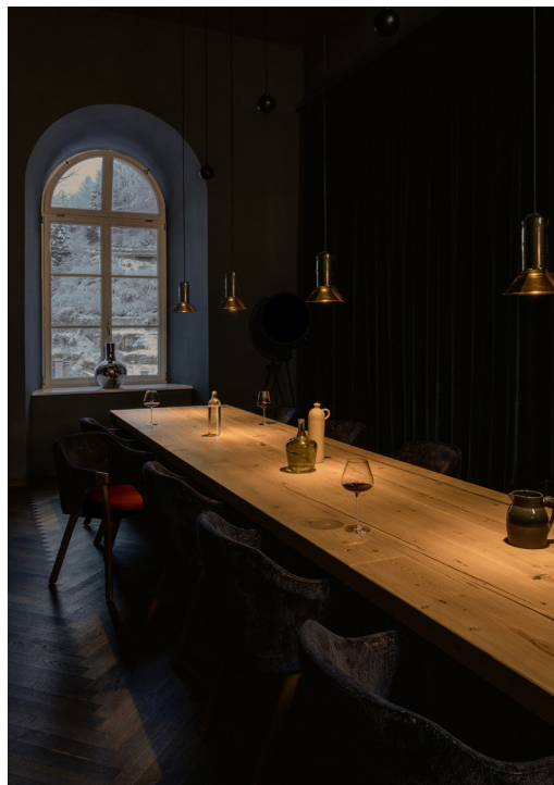
BWM_GrandHotelStraubinger_ ChefsTable_©BWM_DesignersArchitects_ AnaBarros