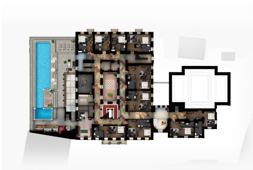
BWM_Bad Gastein_Grand Hotel Straubinger_first- floor