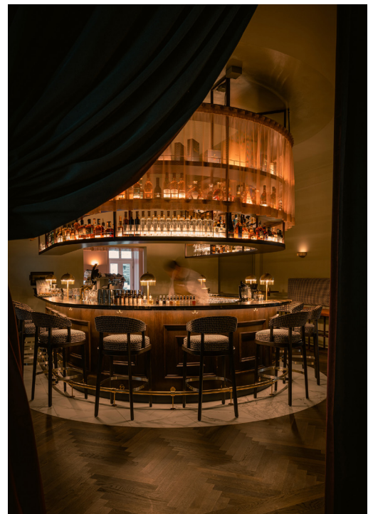
BWM_Bad Gastein_Grand Hotel Straubinger_ Bar ©BWM_Designers & Architects_ Ana Barros