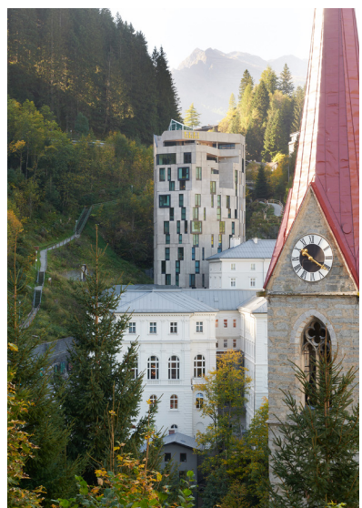
BWM_Bad Gastein_Hotelensemble_02 ©BWM_Designers & Architects_Lukas Schaller