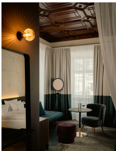
BWM_Bad Gastein_Grand Hotel Straubinger_Pine Suite01©BWM_Designers & Architects Ana Barros